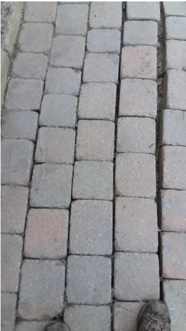
After many hours of power washing, my son had the interlock